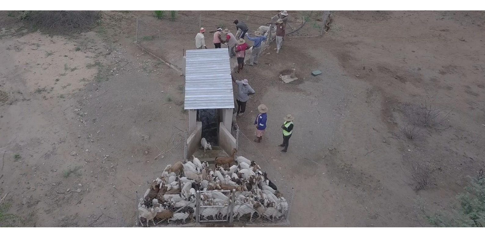
Goat dipping in progress at the Gwanda Goat Improvement Centre

The GICs are hubs for small and medium-scale goat producers constructed to offer various services such as breed improvement, dipping, veterinary drug sales, sale of fodder seed, and aggregation of bulk slaughter and breeding stock.