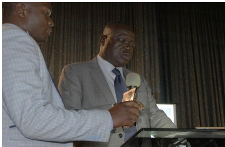
Hon Air Chief Marshal Perrance Shiri (Retired), the Minister of Lands, Agriculture, Water, Climate and Rural Resettlement, giving the keynote address at the launch.