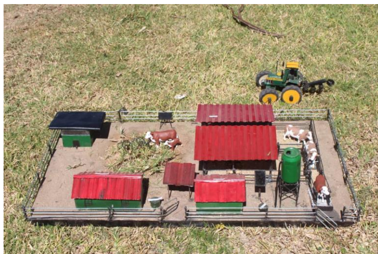
A small-scale model of the Cattle Business Center (CBC).

BEST will capacitate NF by supplying heifers to expand the number of commercial farmer participants up to 100.