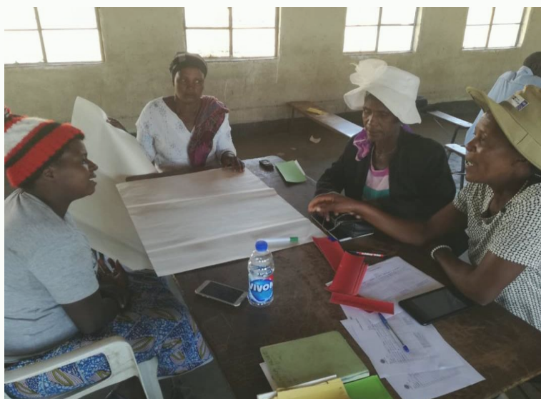
Gokwe women farmers in consultation for the development of Kurima Mari Beef mobile application.

The ICT4D component will play a pivotal role in supporting extension services in the BEST project. Tailor made information technology innovations will be embedded in project activities to ensure successful achievement of project deliverables.