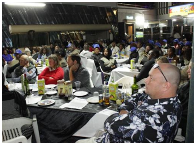
The launch event was attended by at least 200 people including dairy farmers, farmers' associations, government officials, and the private sector.

The Transforming Zimbabwe's Dairy Value Chain for the Future project was officially launched on 17 July 2019 in Nyanga district, in Manicaland Province. The EURO seven million project is being implemented by We Effect, in partnership with the Zimbabwe Association of Dairy Farmers (ZADF), Zimbabwe Farmers Union (ZFU) and Zimbabwe Dairy Industry Trust (ZDIT) launched the project. At least 300 people attended, including dairy farmers, farmers' associations, government officials, and the private sector.