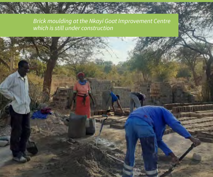
Brick moulding at the Nkayi Goat Improvement Centre which is still under construction