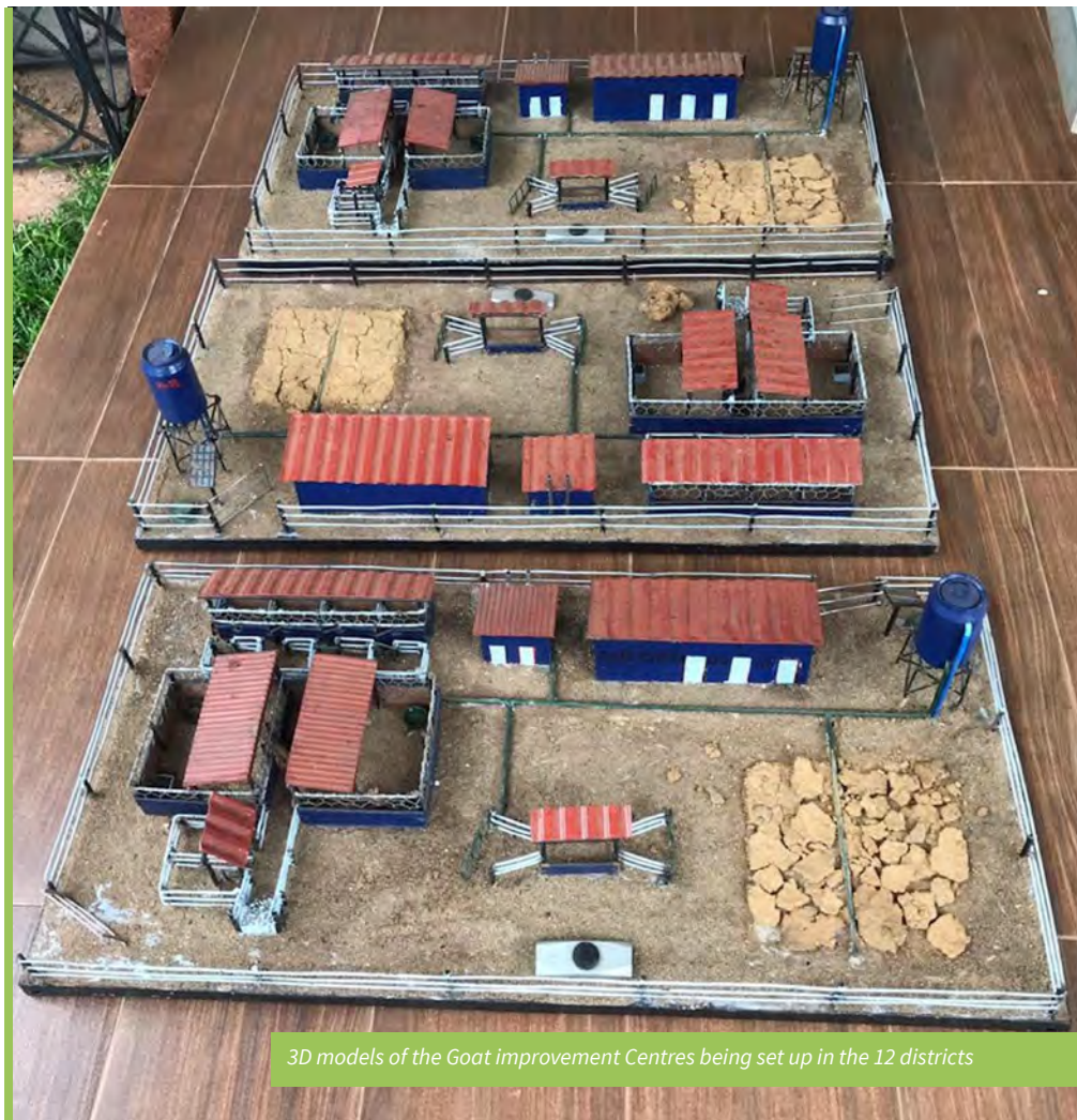
3D models of the Goat improvement Centres being set up in the 12 districts

Out of a total of 12, works have started in the Districts, with communities collaborating in brick moulding and site clearing, and local builders contracted for the construction works. In the remaining 6 Districts, all preparatory activities have been carried out.