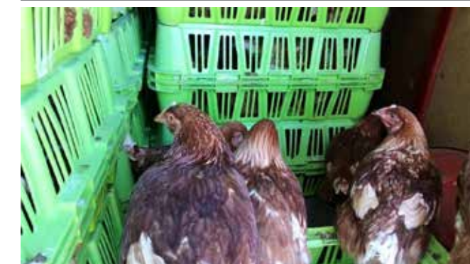
Figure 11 Point of Lay bird

Furthermore, all PBAs have been making veterinary drugs accessible to farmers through the veterinary drugs bulk purchase.