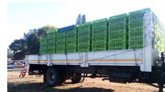
Figure 10 Point of Lay delivery

beneficiaries, 5722 point-of-lay birds were sold to all the project 5 clusters. At this point in time, most of the chickens are above 80% lay rate – statistics coming from Harare and Mutare Clusters. For second batch, the POL (around 1800 birds) were sold out by mid-September 2021.