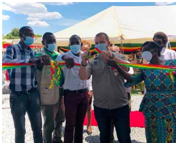
Figure 8: Deputy Minister of Lands, Agriculture, Fisheries and Rural Settlement cutting the ribbon at the Kwekwe live bird and egg official launch

The live bird markets have a capacity of 1 584 birds and stainless tables for egg trays.