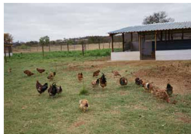
Figure 4: Semi-intensive grazing

The trials are being conducted on two fronts, firstly using an intensive communal grazing model and a semi-intensive grazing model adapted for commercial rearing. The extensive sides mimic the traditional way of rearing road runners where they are let out to grazing without additional supplements. This is compared with the semi extensive grazing model where the dual-purpose