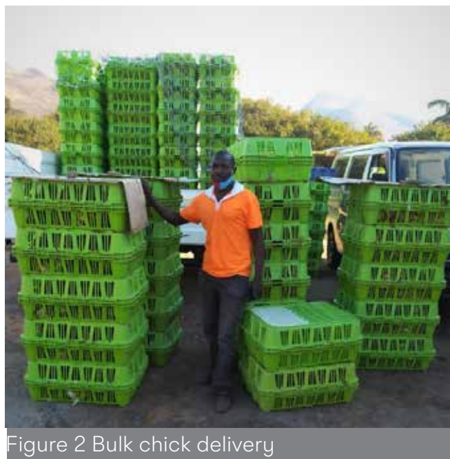
Figure 2 Bulk chick delivery

The project is assisting farmers with accessing day-old chicks at a discounted price. Registered PBA members get to save between $0.05 - $0.10 per bird by buying at the PBA for a $1.00 per bird. The market price for day old chicks is ranging from $1.05 - $1.10. As of January 21 st , 2022, the project had sold 350 762-day-old chicks to registered members of its PBAs.