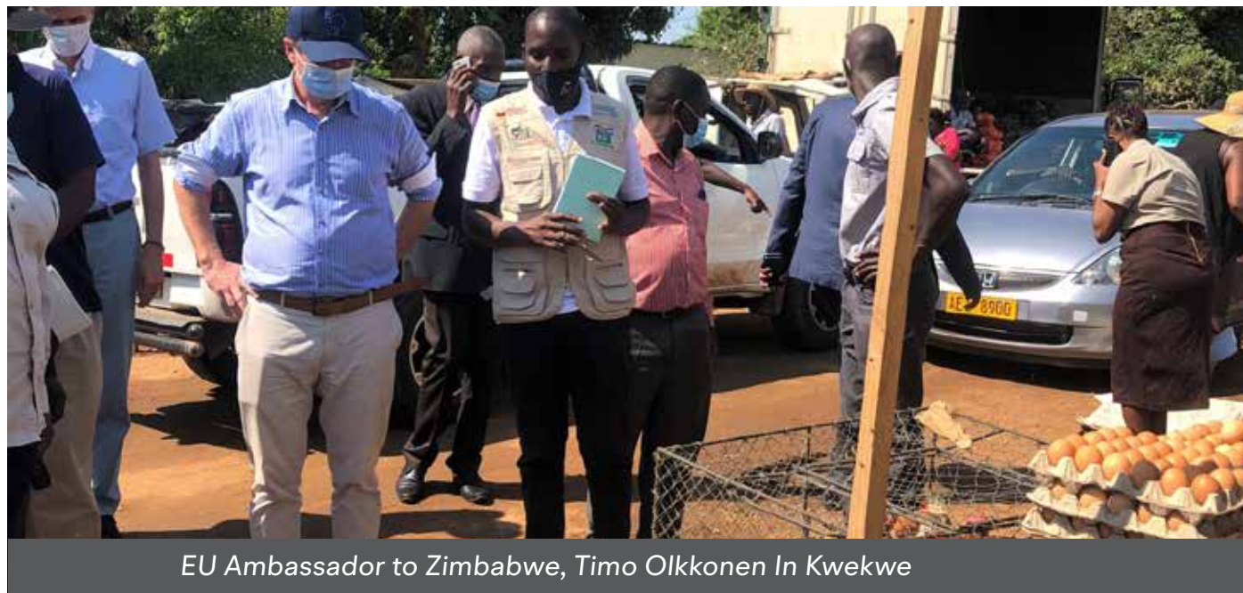
EU Ambassador to Zimbabwe, Timo Olkkonen In Kwekwe

birds in every quarter for the benefit of SMPs.