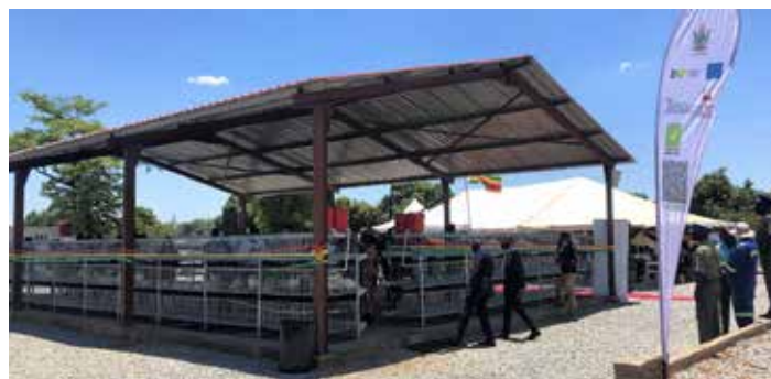
Figure 7 Kwekwe marketplace

Through the project's Poultry Business Units (PBUs) in Harare, Masvingo, Gweru, Mutare and Bulawayo, poultry farmers are being linked to the market through live market sheds for live bird and egg selling and providing butchery facilities for cold dressed birds selling for SMPs.