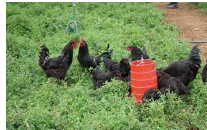
Figure 6: Black Astrolop breed in intensive grazing

One hundred and forty chickens were delivered to Matopos Research Institute for the project on the 3 rd of June 2021.