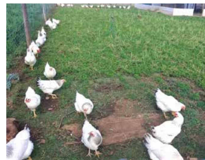
Figure 5 Sasso breed in semi-intensive grazing

Due to the increase in the cost of feed, the trials seek to measure the efficiency in saving feed, or in alternative feed regimens. Additionally, dual-purpose breeds have a threefold purpose which are for meat purposes (cocks), sell of table eggs as well as for breeding (day old chicks and point of lay). They are expected to realize more profits for the communities by providing more than one alternative source of income to the farmers who adopt them.