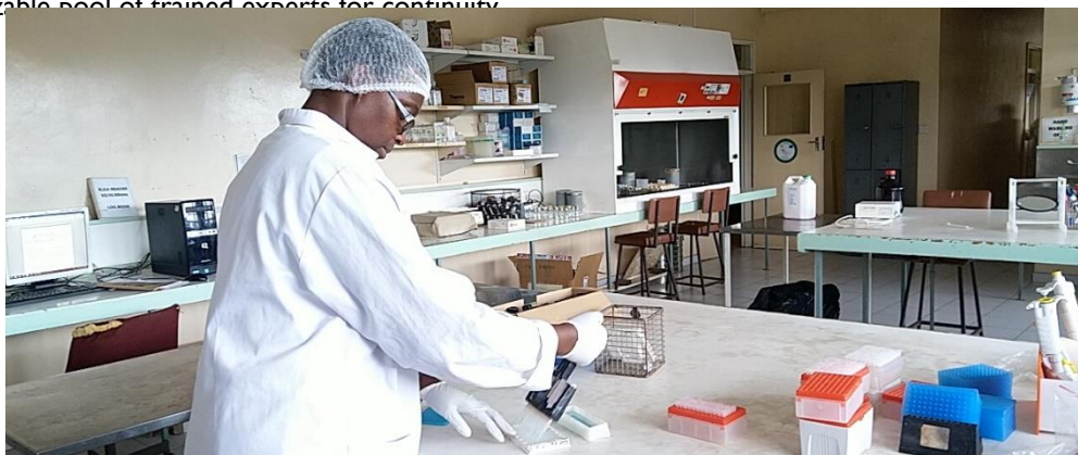
ISO accreditation of the Government laboratories will enhance their technical competency, acceptability and marketability.