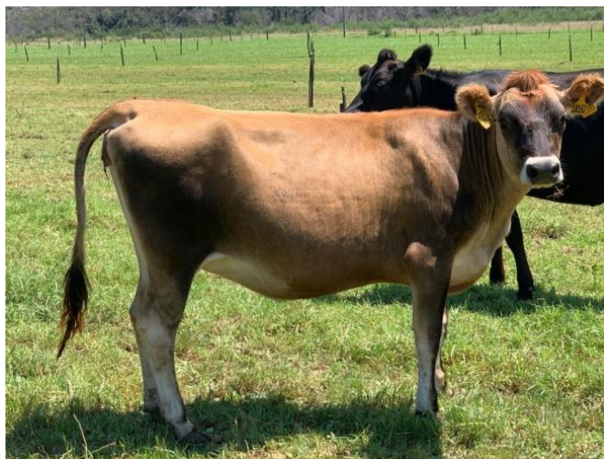
Part of the heifers purchased by the project in Cape Town, South Africa.